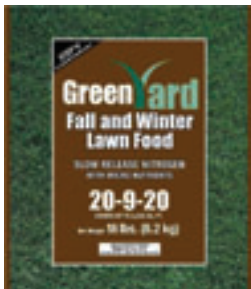
Step Four 20-9-20 20% SCU Fall & Winter