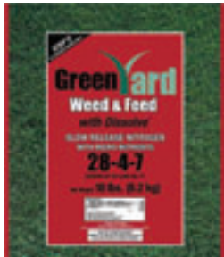
Step Two 28-4-7 30% SCU Weed & Feed