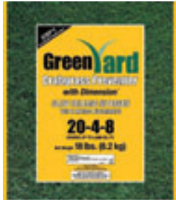
Step One 20-4-8 50% SCU Crabgrass Control

Choose the fertilizer products that's right for your unique lawn. If a program is right for your lawn, choose from a select combination of professional turf fertilizers to realize greater value in caring for your lawn.