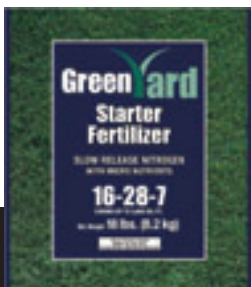
16-28-7 33% SCU Starter Lawn Food