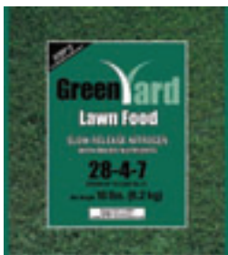
Step Three 28-4-7 30% SCU Lawn Food